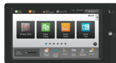
Award-winning 10.1" (diagonal) customizable touchscreen display.