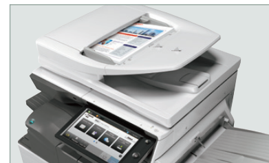
Sharp's ImageSEND™ feature provides one-touch distribution to email, cloud applications and more.