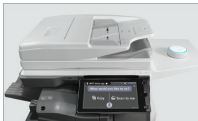
MX-M6051 shown with available Sharp MFP Voice feature with Alexa.